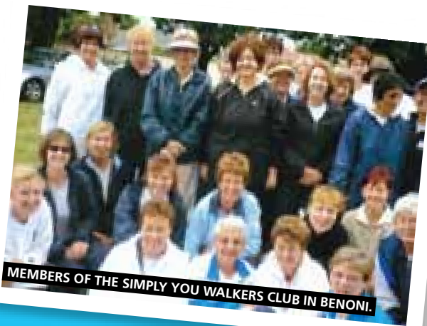
MEMBERS OF THE SIMPLY YOU WALKERS CLUB IN BENONI.

The club has grown from a handful of women in January 1988 to a very sociable club with members ranging in age from 25 to 75. The club is affiliated to the calisthenics exercise studio belonging to Lynn Croall. If you want to know more about the club, contact Veronica de Kleyn on 074 104 2602 or 082 540 7371.